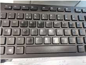
Keyboard used for a long period by an English speaker: the letters E, O, T, H, A, S, I, N, R show substantial wear; some wear is visible on D, L, U, Y, M, W, F, G, C, B, P; and little or none on K, V, J, Q, X, Z.

A June 2012 analysis using a text document containing all words in the English language exactly once, found (s) to be the most common starting letter for words in the English language, followed by (p, c, a). [21]