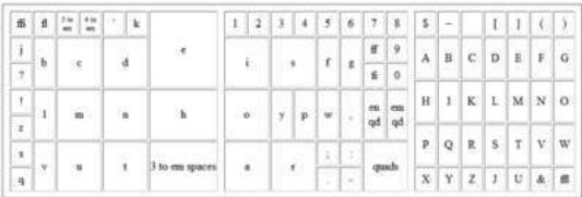
The California Job Case was a compartmentalized box for printing in the 19th century, sizes corresponding to the commonality of letters